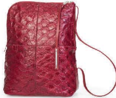
Ref: DG013/01 Red