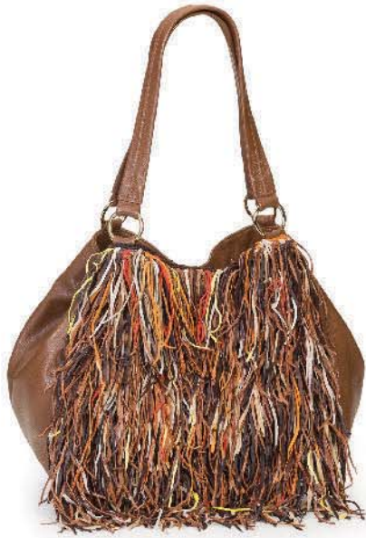
Ref: DG018/02 Brown Mix

Anahí - DG018 Shopping Bag in cowhide and goat skin leather H: 51cm W: 30cm D: 27cm