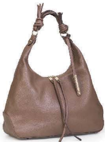
Ref: DGO40/04 Caramel