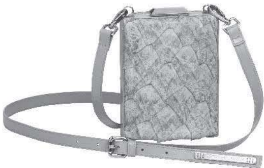
Ref: DG112/06 Grey