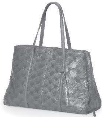
Ref: DG012/05 Blue