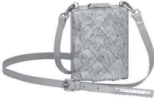
Ref: DG112/05 Blue