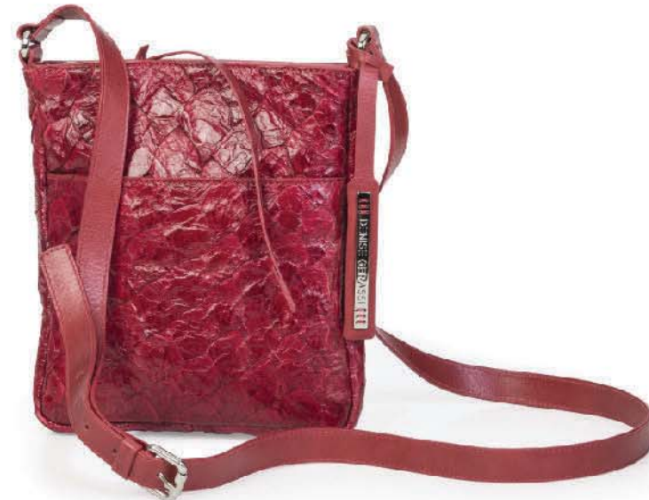
Ref: DG102/01 Red