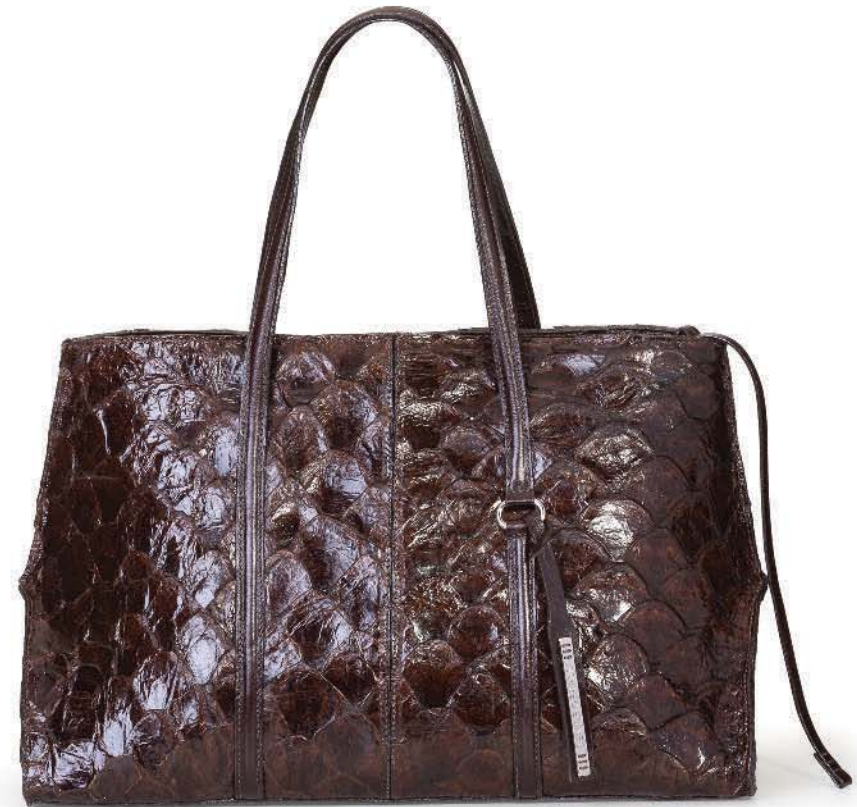
Ref: DG012/02 Coffee