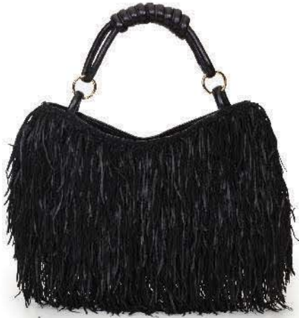
Ref: DG019/03 Black Mix