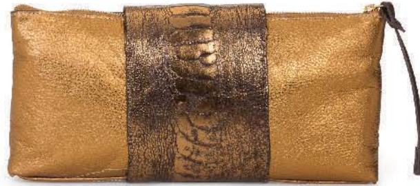
Ref: DG028/01 Copper

Guaraúna - DG028 Clutch in metallic cowhide with metallic ostrich leg applied on the front H: 16cm W: 33cm D: 4cm