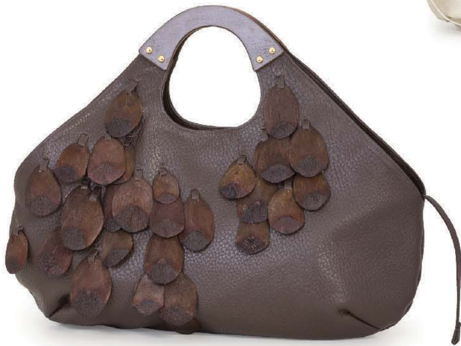
Ref: DG010/02 Coffee