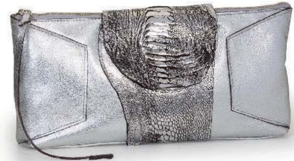
Ref: DG028/02 Silver