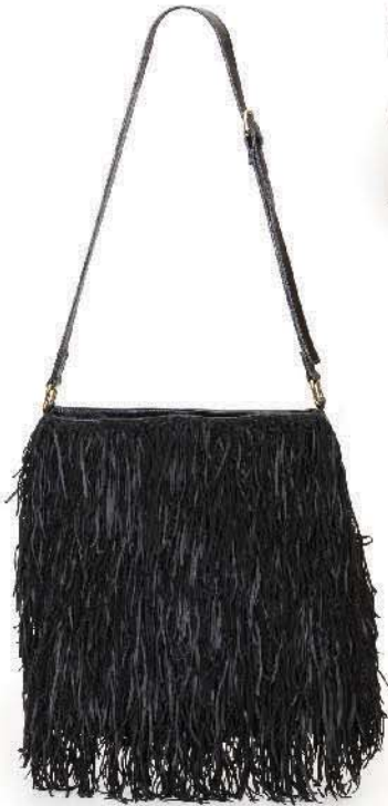
Ref: DG020/03 Black Mix