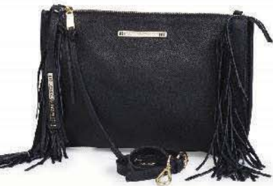
Ref: DG108/05 Black