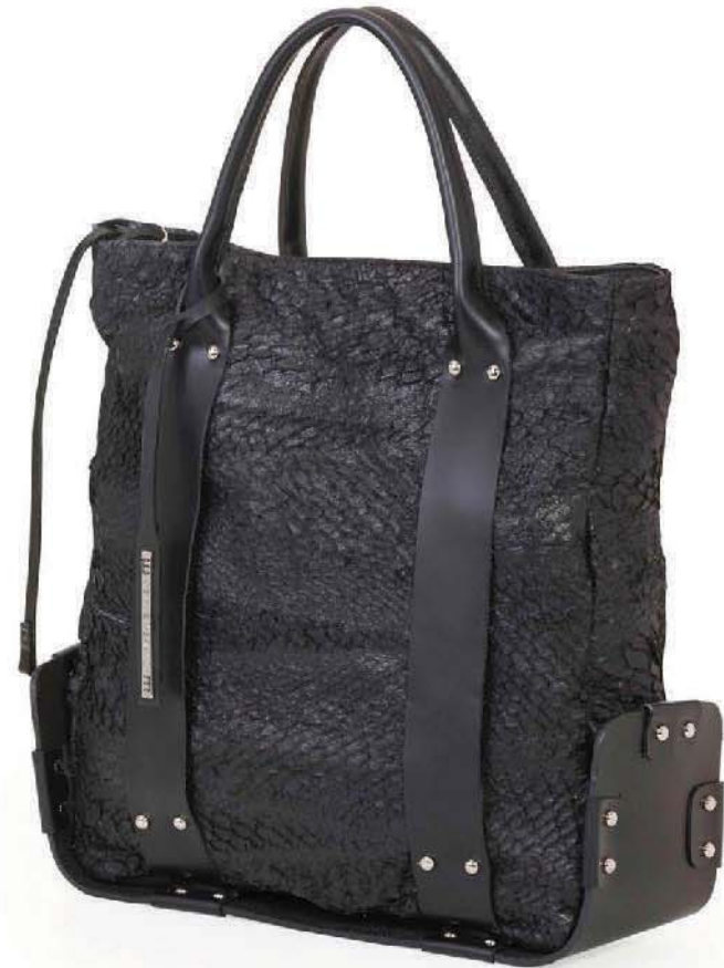
Ref: DG015/03 Black/Black