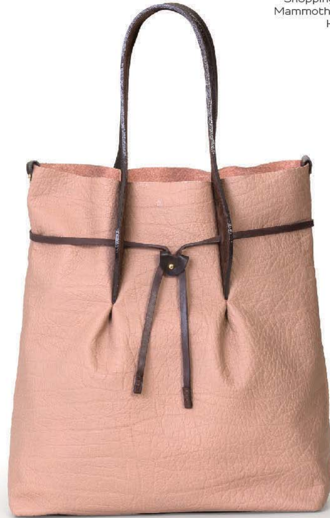
Ref: DG006/02 Sand