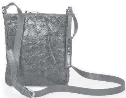
Ref: DG102/06 Grey