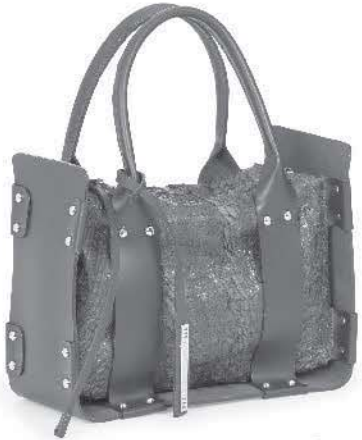
Ref: DG017/06 Wine/Black