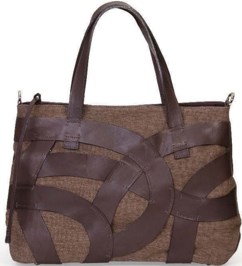
Ref: DG024/02 Havana/Coffee