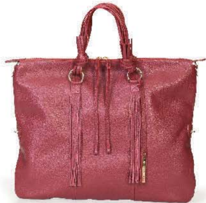
Ref: DG039/02 Ruby