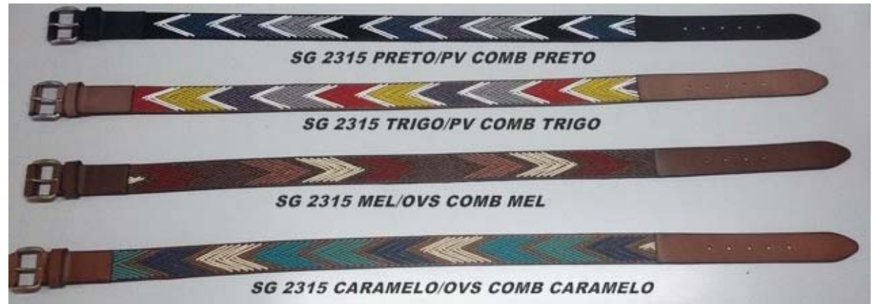
SG 2315 PRETO/PV COMB PRETO