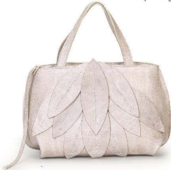
Ref: DG002/03 Off White