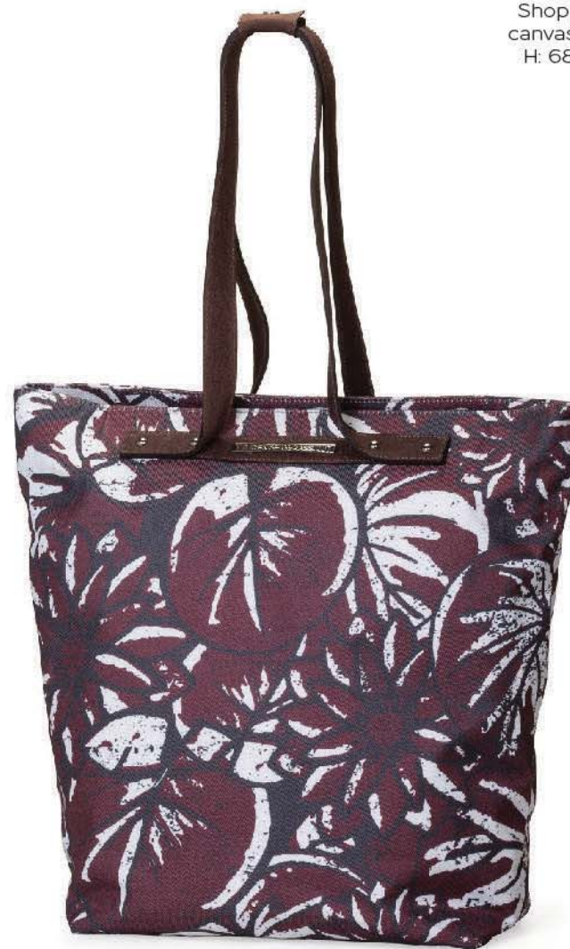
Ref: DG110/03 Wine