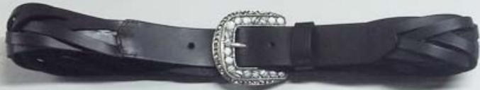
SG 2317 PRETO/PV BRANCO MESCLADO