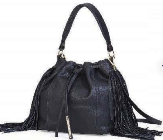
Ref: DG107/05 Black