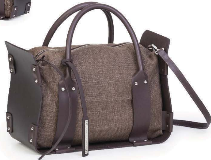
Ref: DG017/04 Coffee/Coffee