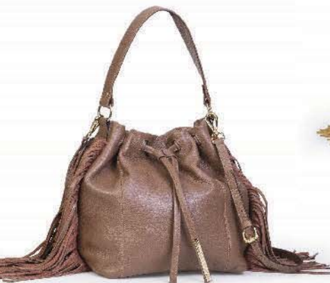
Ref: DG107/04 Caramel

Capotira - DG107 Bucket bag in cowhide, very soft, called Floater. With fringe details H: 50cm W: 30cm D: 15cm