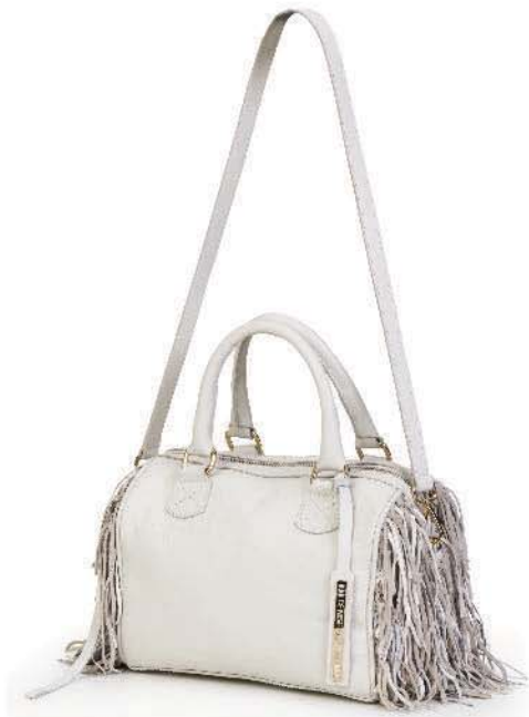
Ref: DG105/01 Neutrals Mix

Japira P - DG105 Mini Bowling Bag in cowhide and goat skin leather H: 31cm W: 23cm D: 13cm