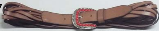
SG 2317 TRIGO/PV PIMENTA