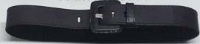
SG 2378 PRETO/PV