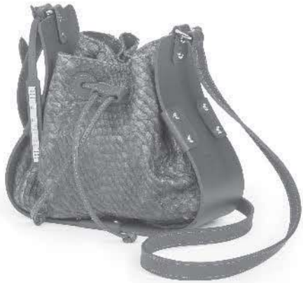
Ref: DG113/04 Wine/Black

Uiara - DG113 Mini Bucket Bag in hake skin and leather straps H: 21cm W: 29cm D: 11cm