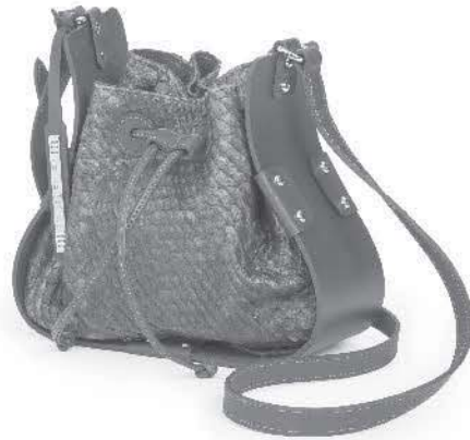
Ref: DG113/03 Black/Black