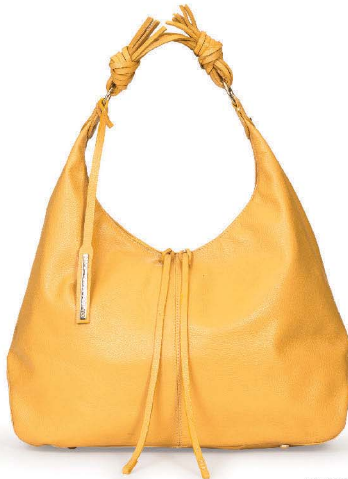
Ref: DGO40/01 Yellow