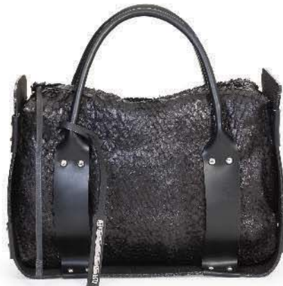
Ref: DG016/03 Black/Black