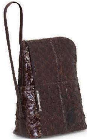
Ref: DG013/02 Coffee