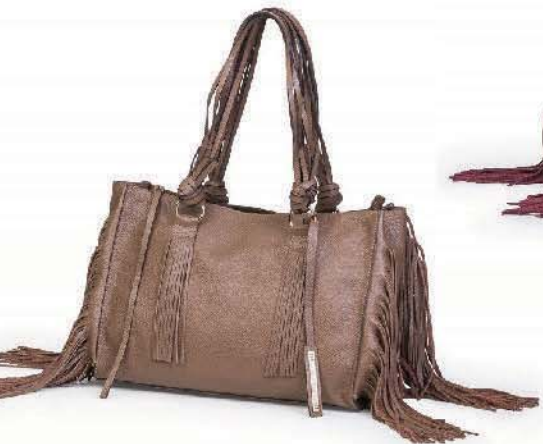
Ref: DG106/04 Caramel