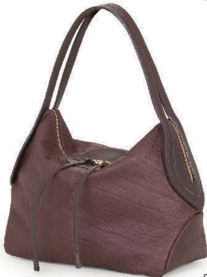
Ref: DG007/03 Coffee