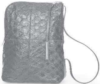
Ref: DG013/06 Grey