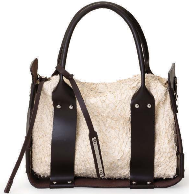
Ref: DG017/01 Nude/Coffee