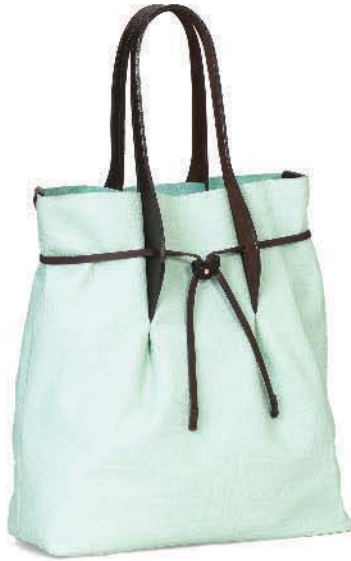
Ref: DG006/01 Light Green

Kauane - DG006 Shopping bag in cowhide named Mammoth with sole strap handles H: 62cm W: 42cm D: 13cm