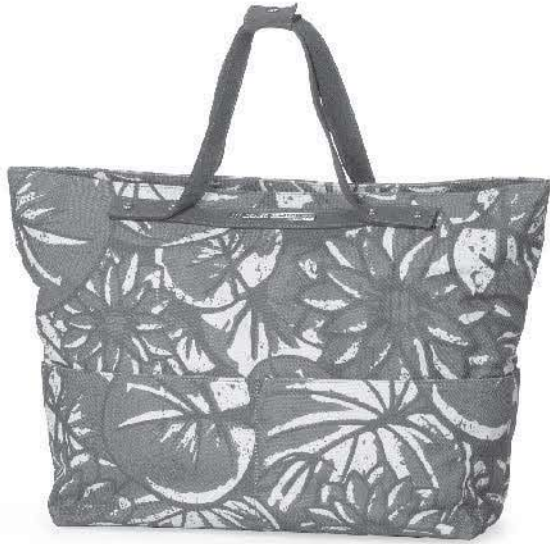
Ref: DG109/02 Orange

Nina - DG109 Shopping bag in in cotton canvas with exclusive print H: 47cm W: 48cm D: 13cm