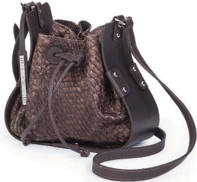
Ref: DG113/02 Coffee/Coffee