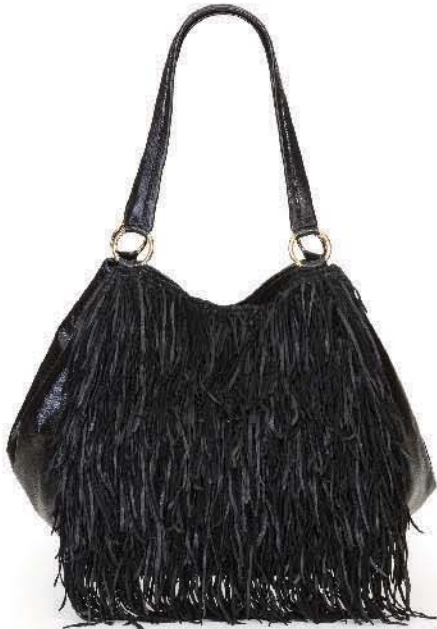
Ref: DG018/03 Black Mix