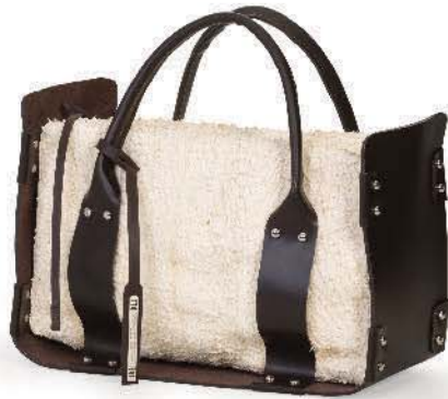
Ref: DG016/01 Nude/Coffee

Aiyra M - DG016 Bowling Bag in hake skin and leather straps H: 34cm W: 33cm D: 14cm