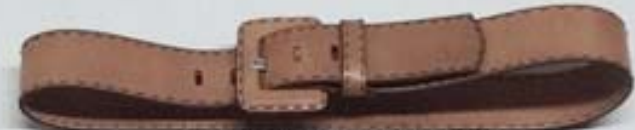
SG 2378 TRIGO/PV