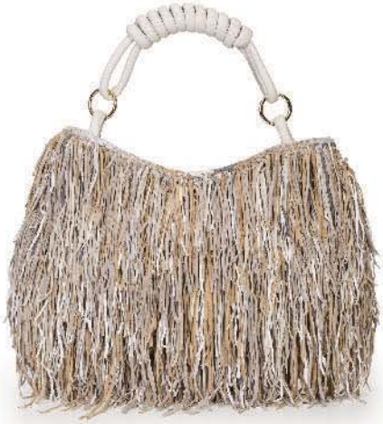
Ref: DG019/01 Neutrals Mix

Nanine - DG019 Handbag in cowhide and goat skin leather H: 37cm W: 44cm D: 10cm