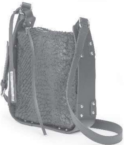
Ref: DG103/05 Grey/Black