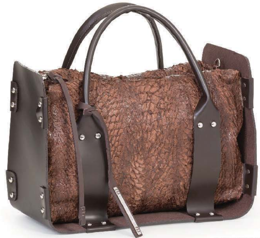
Ref: DG016/02 Coffee/Coffee