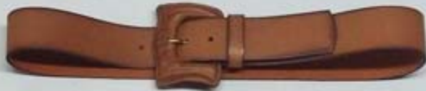
SG 2446 TRIGO/PV