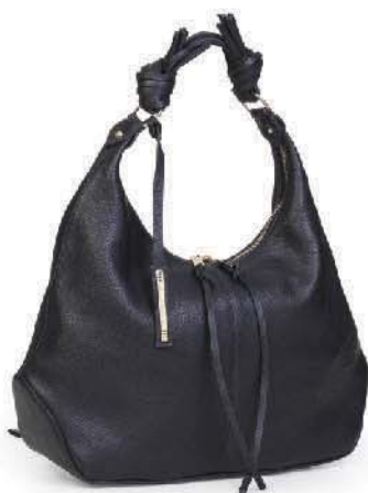
Ref: DGO40/05 Black