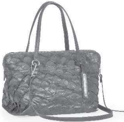
Ref: DG014/05 Blue