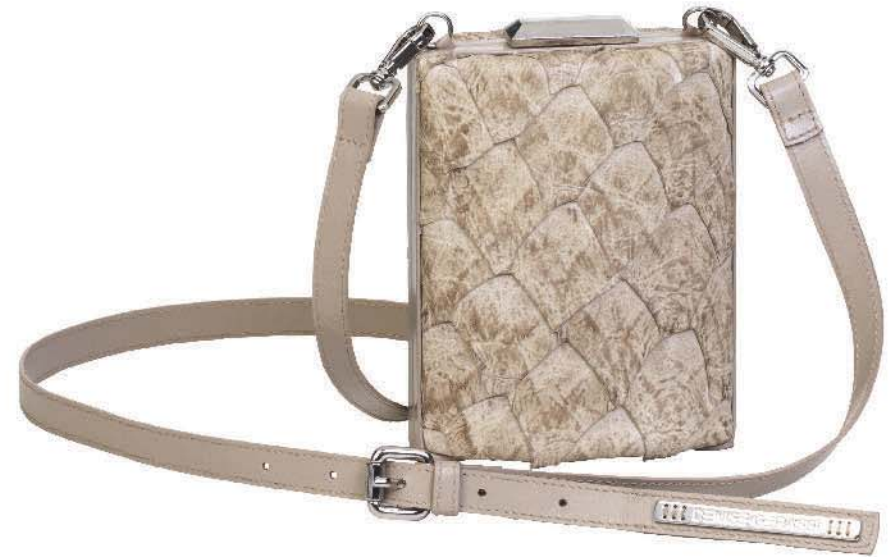
Ref: DG112/04 Camel