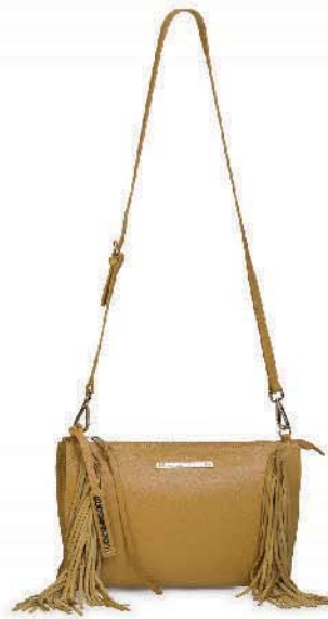
Ref: DG108/01 Yellow