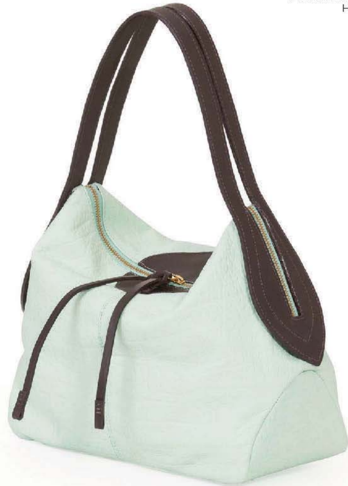
Ref: DG007/01 Light Green