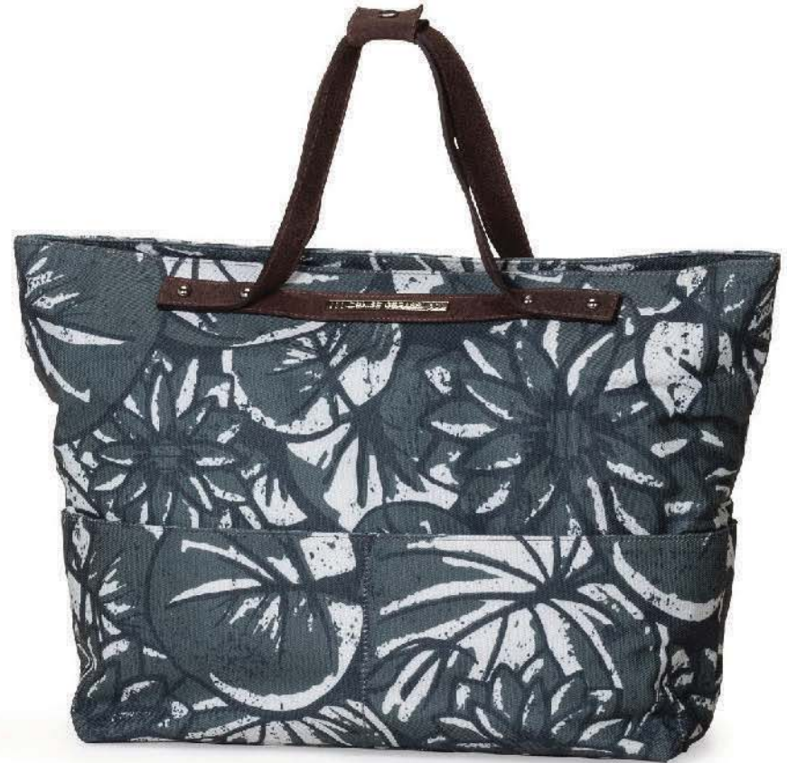
Ref: DG109/01 Green