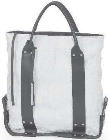
Ref: DG015/04 Wine/Black

Niara - DG015 Shopping Bag in hake skin and leather straps H: 49cm W: 34cm D: 10cm