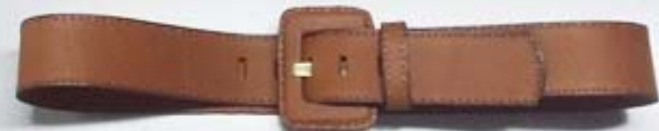
SG 2378 CAMELO/OVS