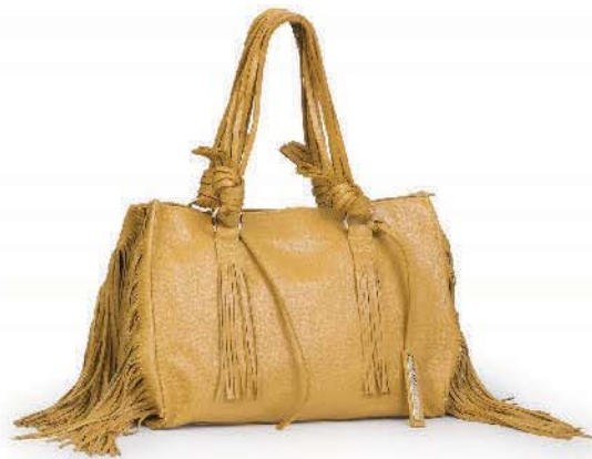
Ref: DG106/01 Yellow