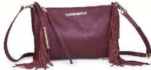
Ref: DG108/02 Ruby