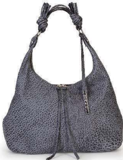
Ref: DG005/03 Black