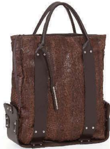
Ref: DG015/02 Coffee/Coffee