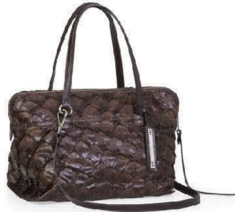
Ref: DG014/02 Coffee