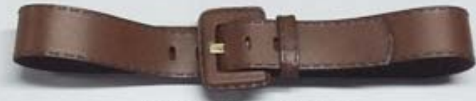
SG 2378 MEL/OVS