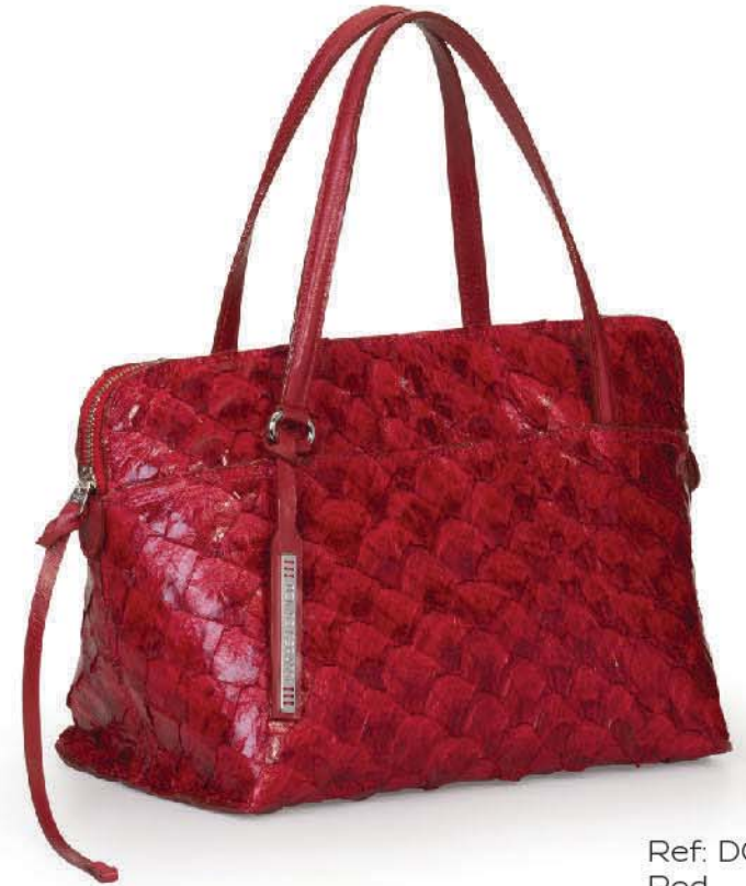
Ref: DG014/01 Red