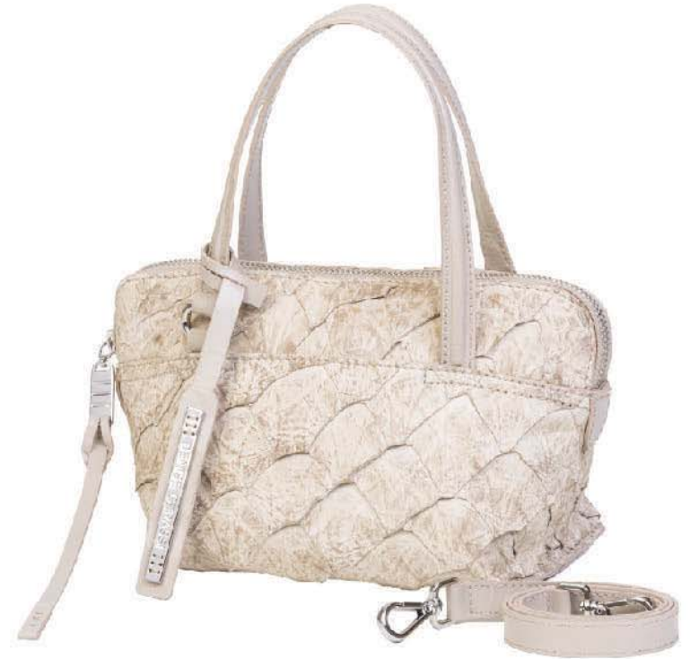
Ref: DG101/04 Camel