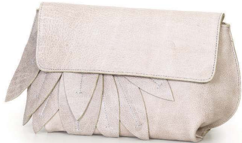
Ref: DG003/03 Off White