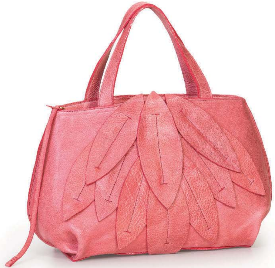
Ref: DG002/01 Guava