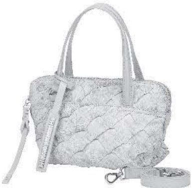
Ref: DG101/06 Grey