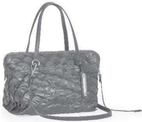
Ref: DG014/04 Camel

Raira M - DG014 Bowling Bag in Pirarucu fish leather H: 40cm W: 49cm D: 19cm