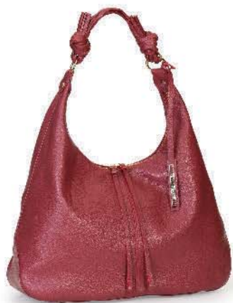
Ref: DGO40/02 Ruby

Janarí - DGO40 Hobo bag in cowhide, very soft, called Floater H: 52cm W: 45cm D: 15cm