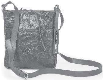
Ref: DG102/04 Camel

Jupira - DG102 Crossbody Bag in Pirarucu fish leather H: 21cm W: 18cm D: 3cm