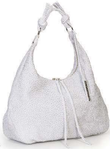
Ref: DG005/01 Feather

Janari - DG005 Hobo bag in sheep leather H: 54cm W: 46cm D: 14cm