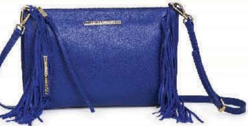
Ref: DG108/03 Blue Bali

Araciara - DG108 Crossbody bag in cowhide, very soft, called Floater. With fringe details H: 21cm W: 34cm D: 7cm