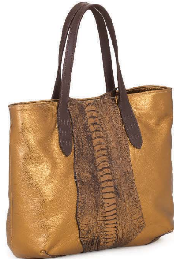
Ref: DG027/01 Copper