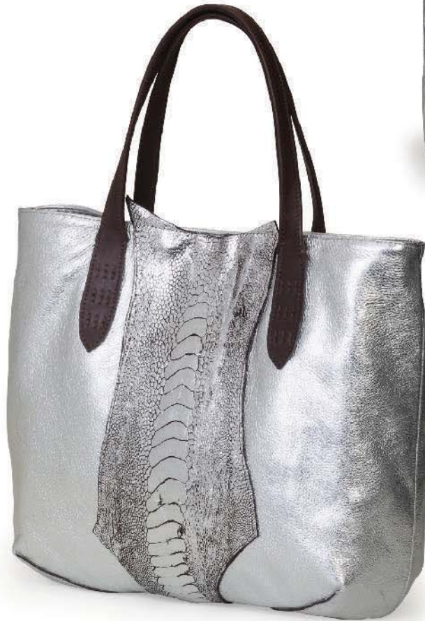
Ref: DG027/02 Silver