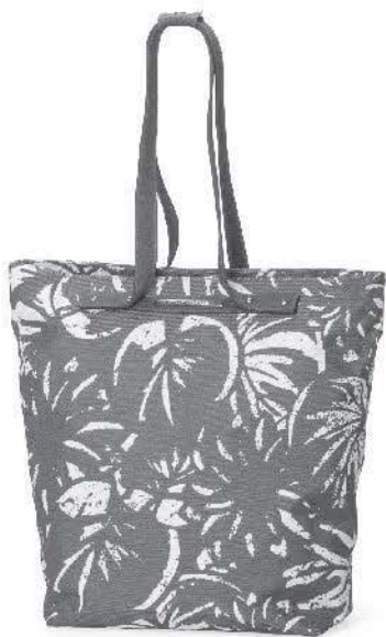
Ref: DG110/01 Green

Guapira - DG110 Shopping bag in in cotton canvas with exclusive print H: 68cm W: 44cm D: 16cm