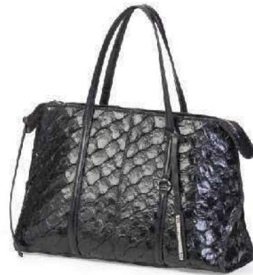
Ref: DG013/03 Black