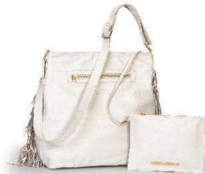
Ref: DG020/01 Neutrals Mix