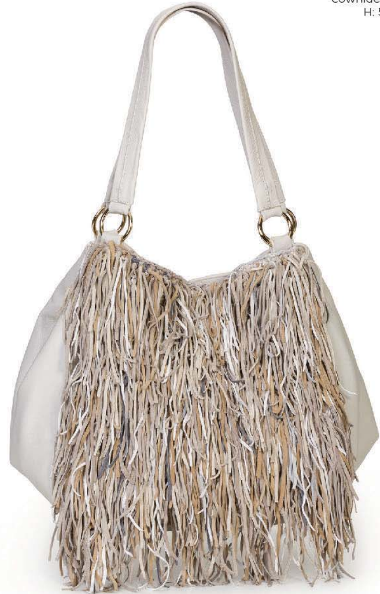
Ref: DG018/01 Neutrals Mix