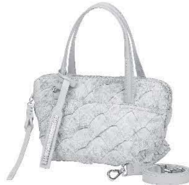
Ref: DG101/02 Coffee