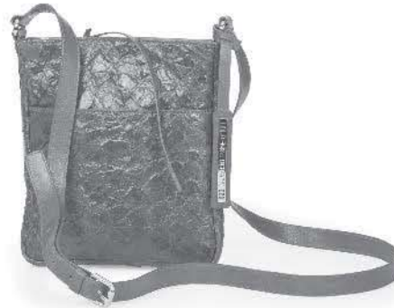
Ref: DG102/02 Coffee