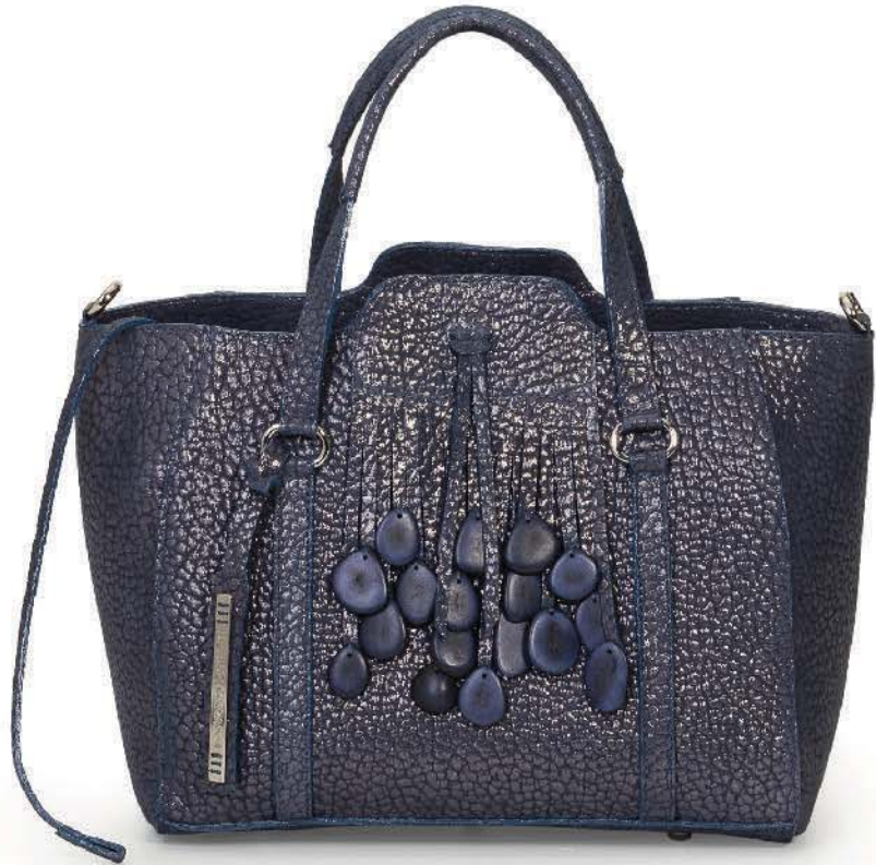
Ref: DG026/02 Night Blue