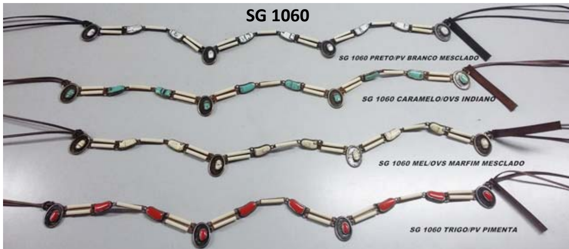
SG 1060 PRETO/PV BRANCO MESCLADO