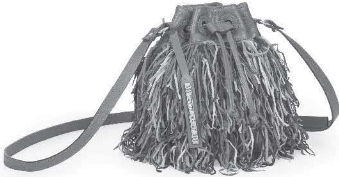
Ref: DG115/01 Neutrals Mix

Itacira - DG115 Mini Bucket Bag in cowhide and goat skin leather H: 19cm W: 23cm D: 12cm