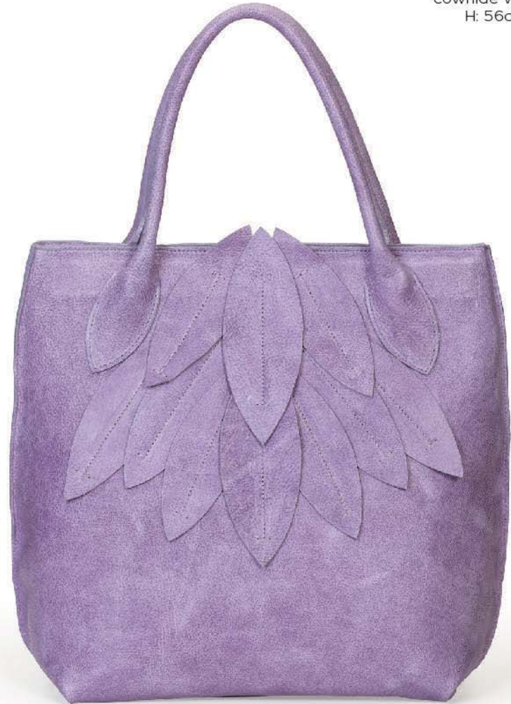
Ref: DG001/02 Hydrangea