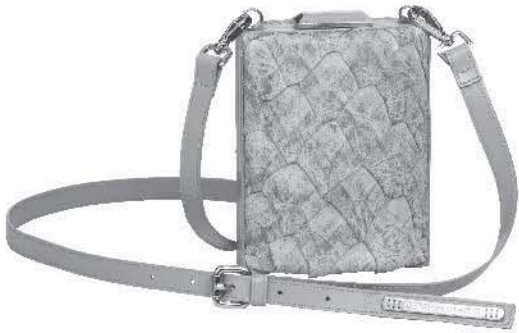
Ref: DG112/03 Black

Aimara - DG112 Clutch in Pirarucu fish leather H: 16cm W: 13cm D: 6cm