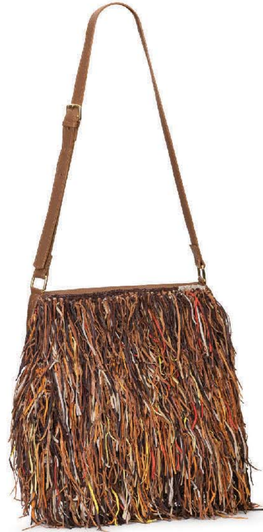
Ref: DG020/02 Brown Mix