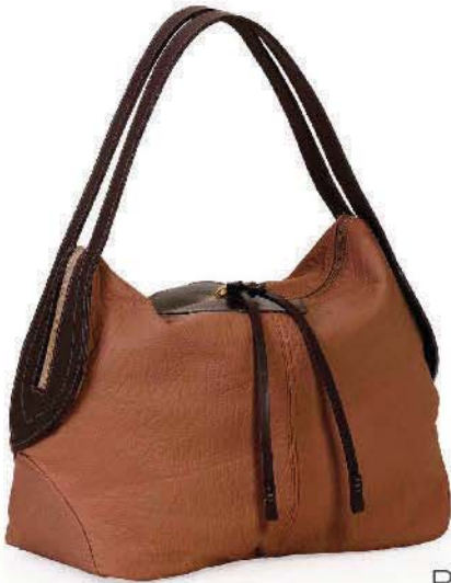
Ref: DG007/02 Sand

Tacira - DG007 Handbag in cowhide named Mammoth with sole strap handles H: 44cm W: 39cm D: 16cm