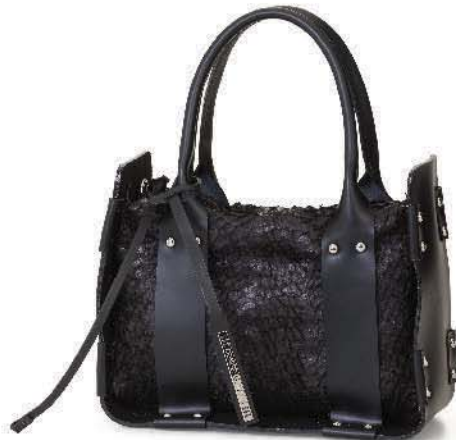
Ref: DG017/03 Black/Black