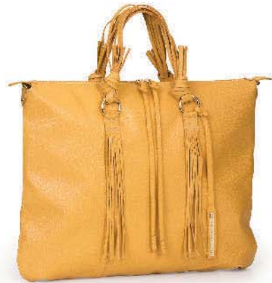
Ref: DG039/01 Yellow