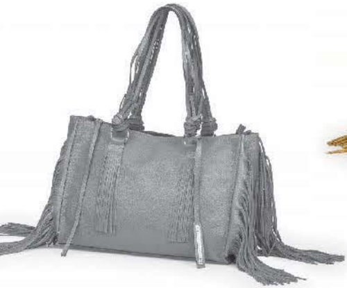
Ref: DG106/03 Blue Bali

Inema - DG106 Shopping bag in cowhide, very soft, called Floater. With fringe details H: 50cm W: 37cm D: 17cm