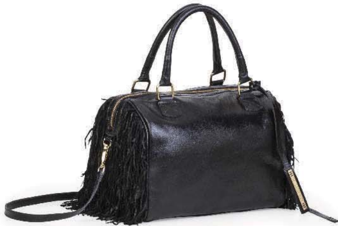
Ref. DG104/03 Black Mix