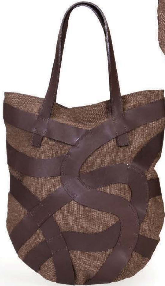
Ref: DG023/02 Havana/Coffee