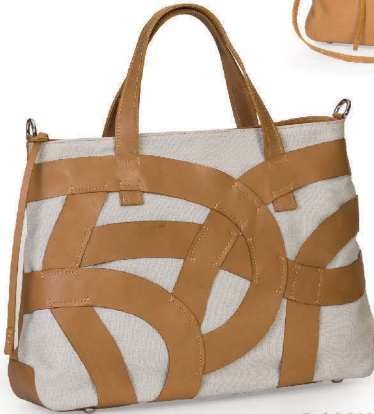
Ref: DG024/01 Ice/Caramel