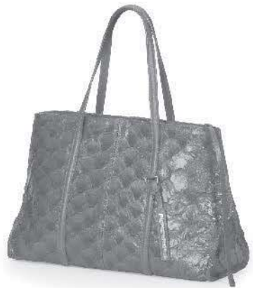
Ref: DG012/04 Camel

Maiara - DG012 Handbag in Pirarucu fish leather H: 47cm W: 48cm D: 16cm