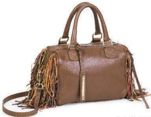
Ref: DG105/02 Brown Mix