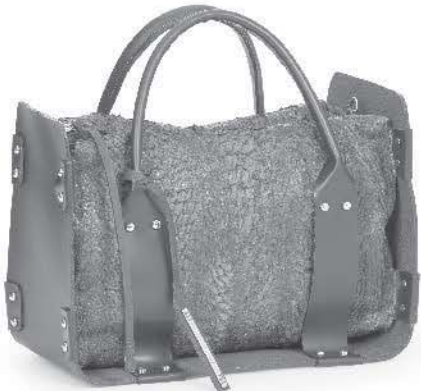
Ref: DG016/05 Grey/Black