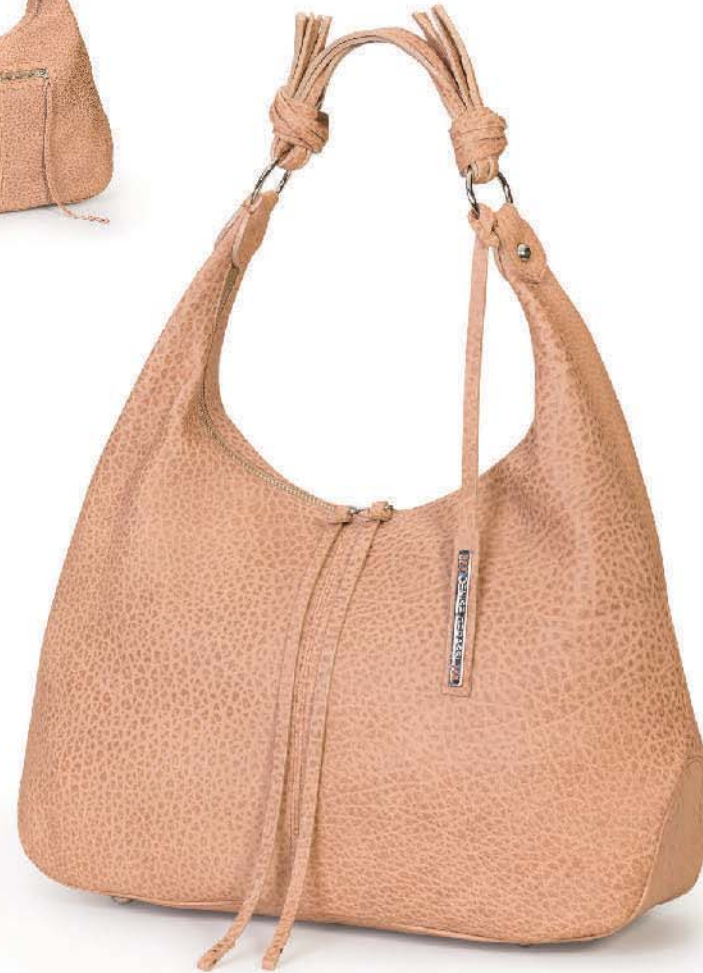
Ref: DG005/02 Caramel