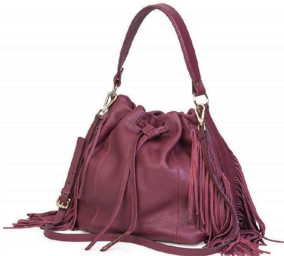
Ref: DG107/02 Ruby