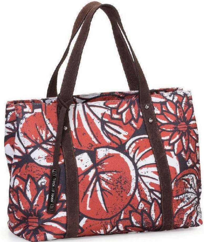
Ref: DGIII/02 Orange