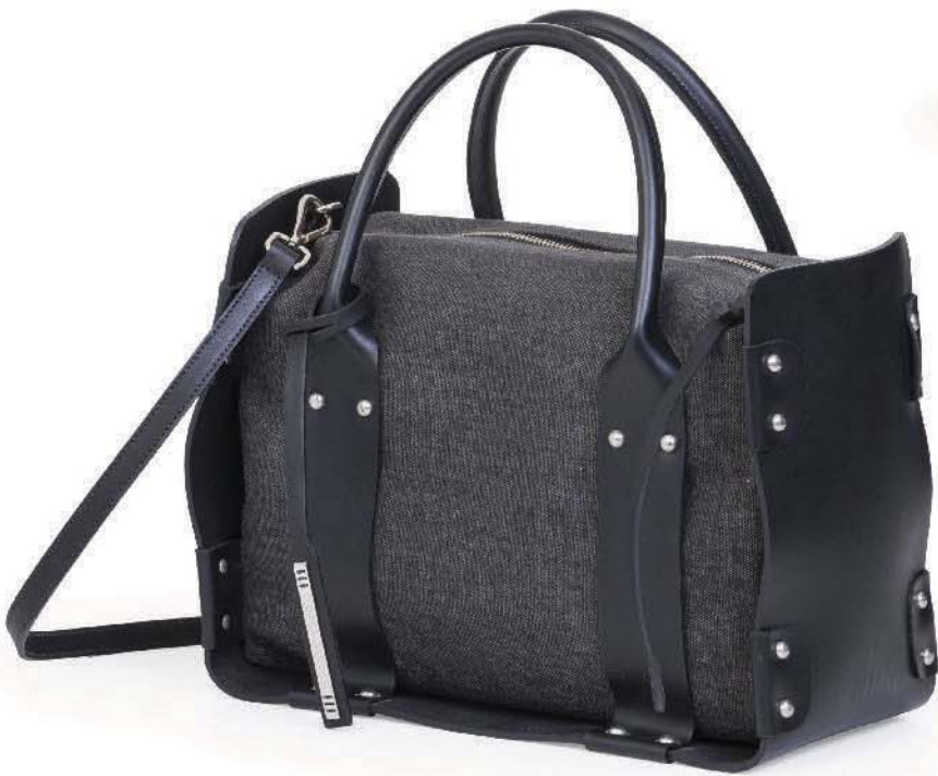
Ref: DG017/05 Black/Black