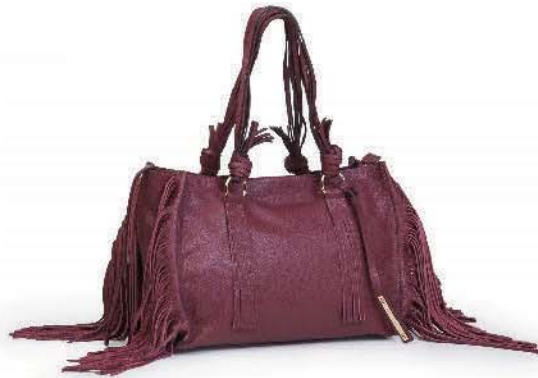
Ref: DG106/02 Ruby