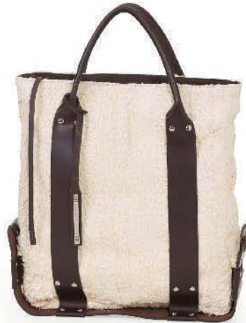
Ref: DG015/01 Nude/Coffee