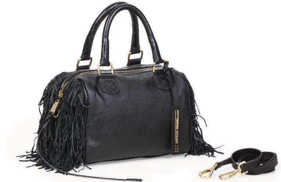
Ref: DG105/03 Black Mix