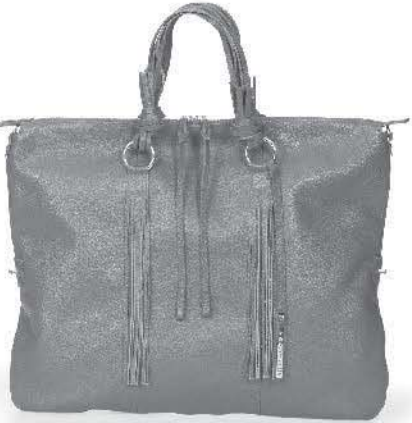
Ref: DG039/04 Caramel

Can be used in three different ways H: 48cm W: 45cm D: 13cm