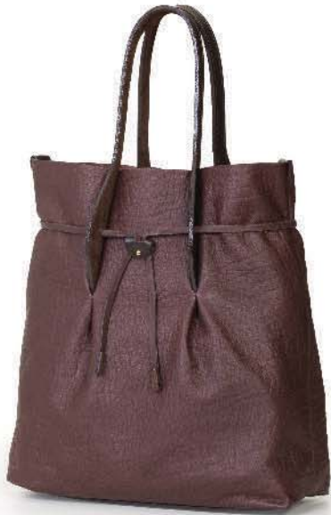
Ref: DG006/03 Coffee