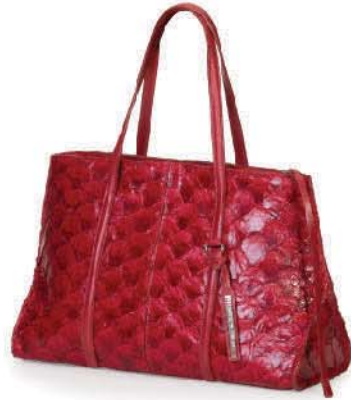
Ref: DG012/01 Red