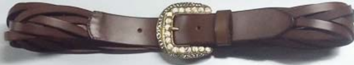
SG 2317 MEL/OVS MARFIM MESCLADO