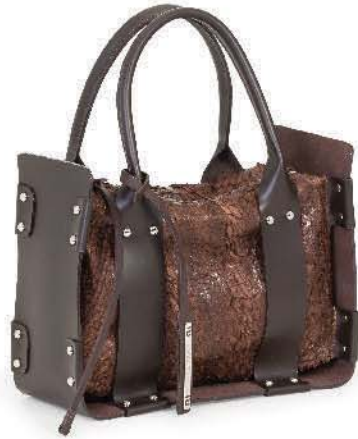
Ref: DG017/02 Coffee/Coffee

Aiyra P - DG017 Mini Bowling Bag in hake skin and leather straps H: 35cm W: 28cm D: 10cm