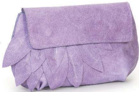
Ref: DG003/02 Hydrangea