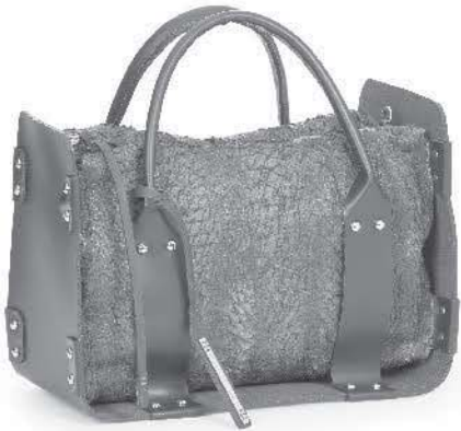
Ref: DG016/04 Wine/Black