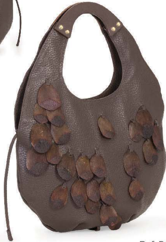
Ref: DG011/02 Coffee