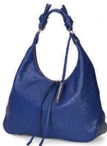
Ref: DGO40/03 Blue Bali