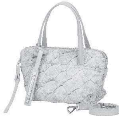
Ref: DG101/05 Blue