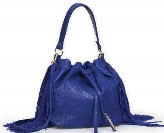
Ref: DG107/03 Blue Bali