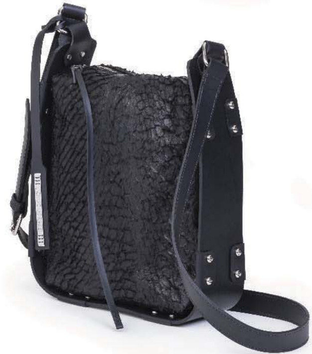
Ref: DG103/03 Black/Black