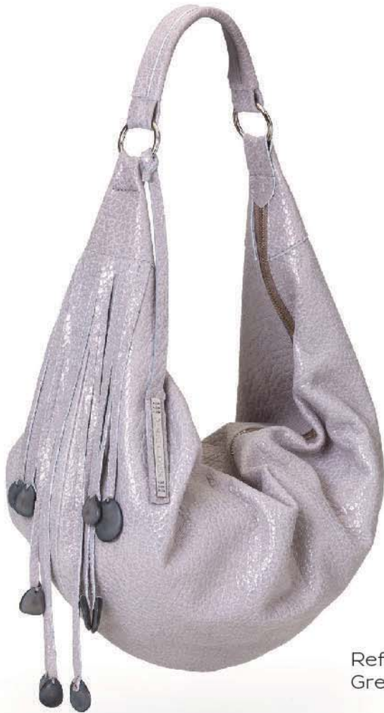
Ref: DG025/01 Grey

Jarina - DG025 Hobo bag in shiny leather, with seed application as detail H: 53cm W: 55cm D: 26cm