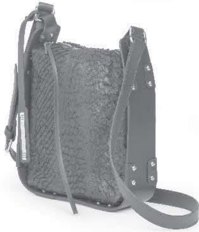
Ref: DG103/01 Nude/Coffee

Iara - DG103 Crossbody Bag in snake skin and leather straps H: 30cm W: 24cm D: 8cm