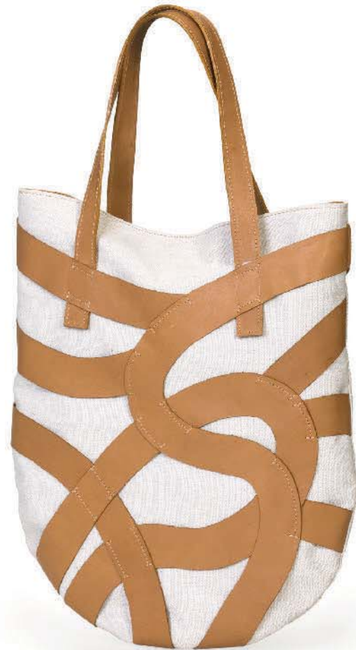
Ref: DG023/01 Ice/Caramel