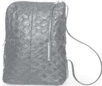
Ref: DG013/05 Blue