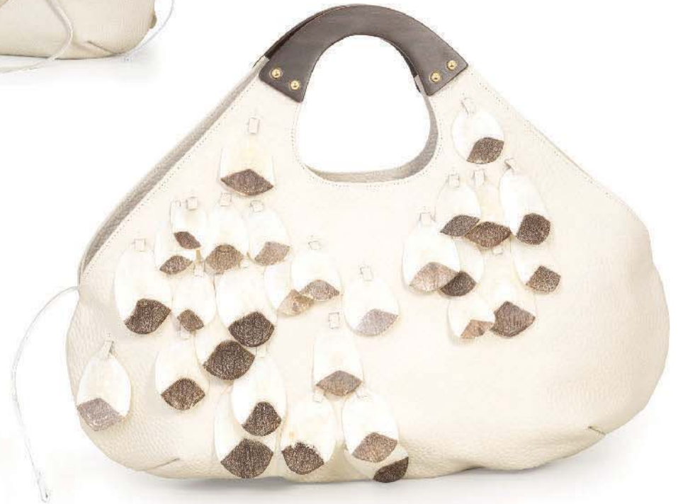
Ref: DG010/01 Cream