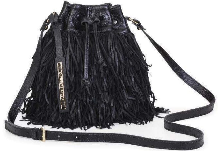
Ref: DG115/03 Black Mix