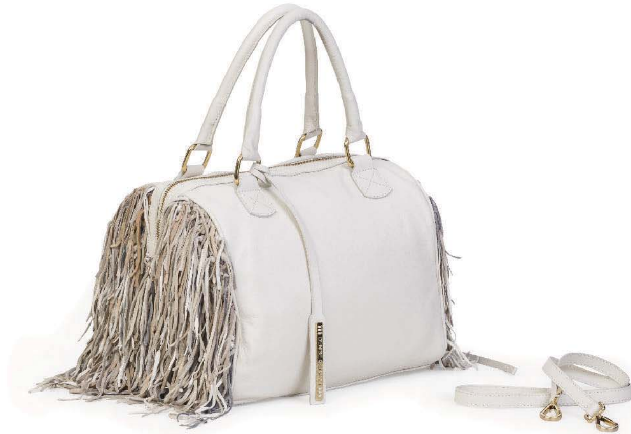
Ref. DG104/01 Neutrals Mix