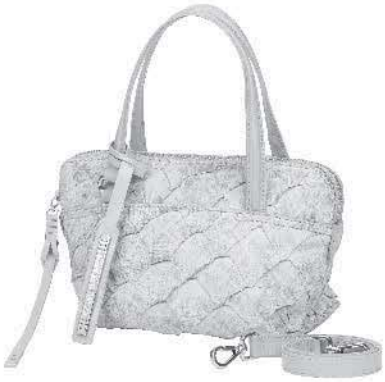
Ref: DG101/03 Black

Raira P - DG101 Mini Bowling Bag in Pirarucu fish leather H: 25cm W: 27cm D: 13cm