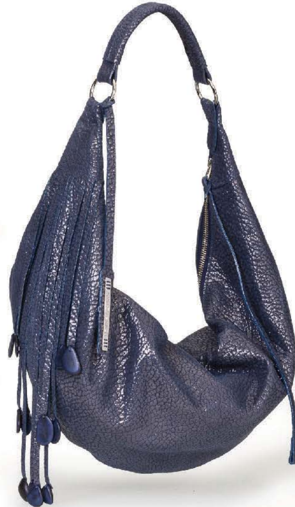
Ref: DG025/02 Night Blue