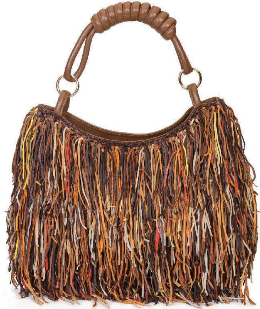
Ref: DG019/02 Brown Mix