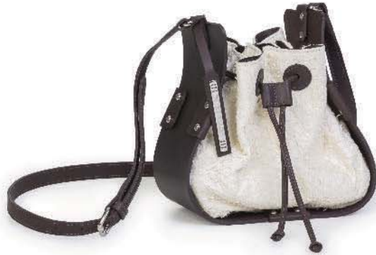
Ref: DG113/01 Nude/Coffee