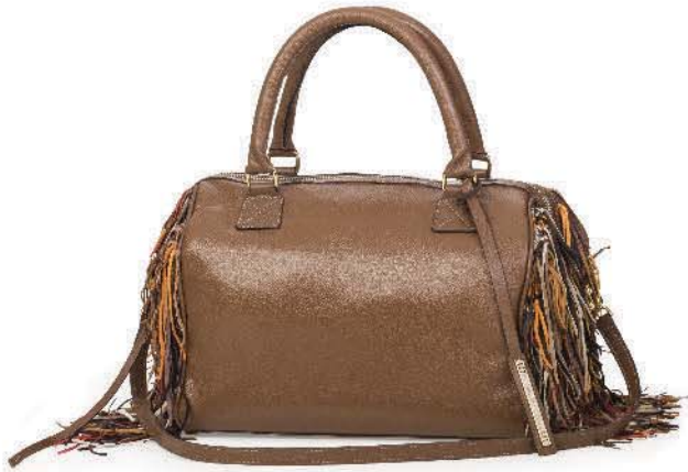
Ref. DG104/02 Brown Mix

Japira M - DG104 Bowling Bag in cowhide and goat skin leather H: 41cm W: 32cm D: 19cm