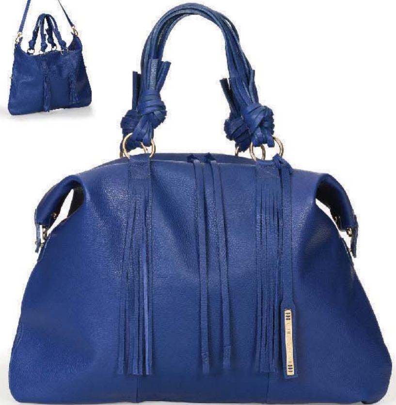
Ref: DG039/03 Blue Bali