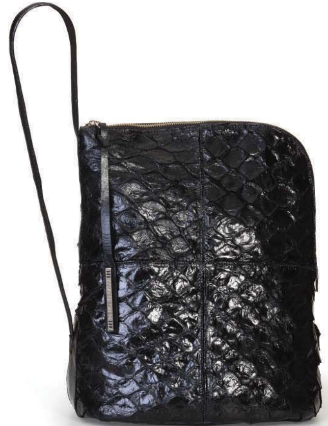
Ref: DG013/03 Black