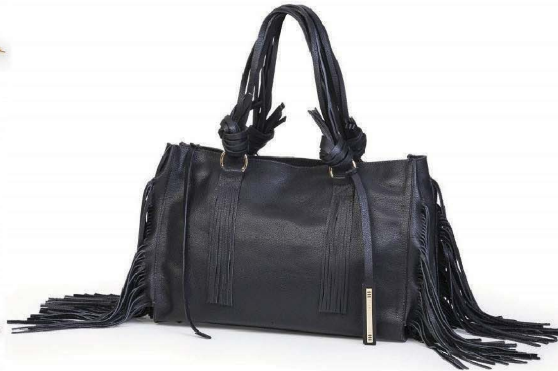
Ref: DG106/05 Black