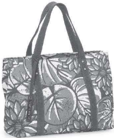
Ref: DGIII/03 Wine