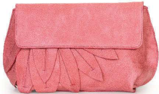
Ref: DG003/01 Guava

Tacira - DG003 Maxi Clutch in cowhide with bi-color effect. H: 21cm W: 36cm D: 11cm