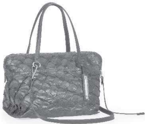
Ref: DG014/06 Grey