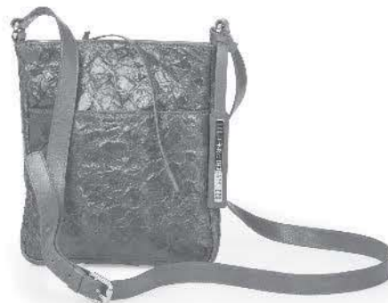
Ref: DG102/03 Black