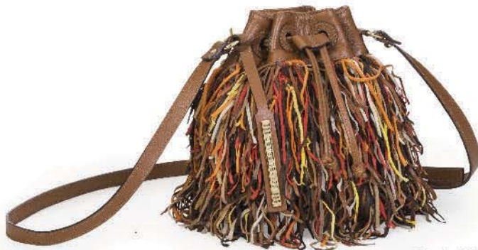
Ref: DG115/02 Brown Mix