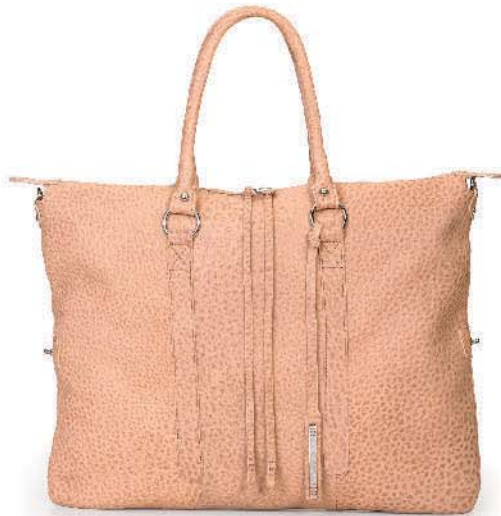
Ref: DG004/02 Caramel