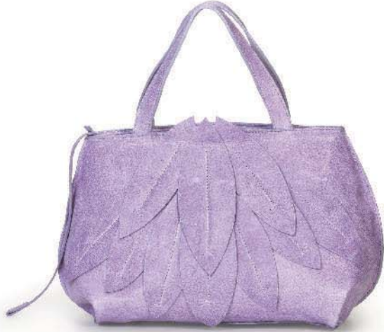
Ref: DG002/02 Hydrangea

Acira - DG002 Handbag in cowhide with bi-color effect. H: 34cm W: 41cm D: 18cm