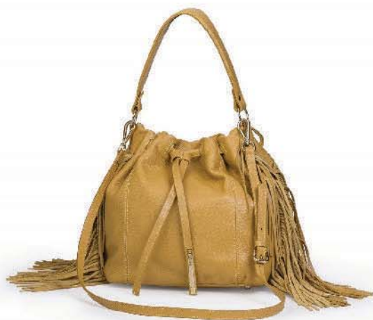
Ref: DG107/01 Yellow