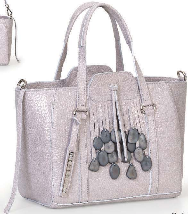
Ref: DG026/01 Grey