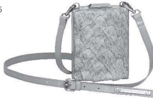
Ref: DG112/02 Coffee