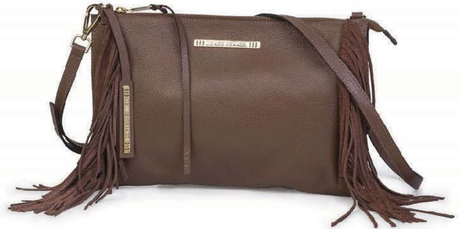
Ref: DG108/04 Caramel