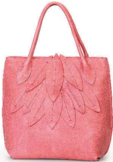
Ref: DG001/01 Guava

Roama - DG001 Shopping Bag in cowhide with bi-color effect. H: 56cm W: 45cm D: 17cm