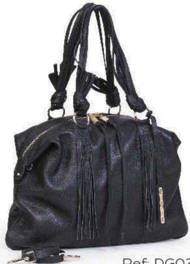
Ref: DG039/05 Black