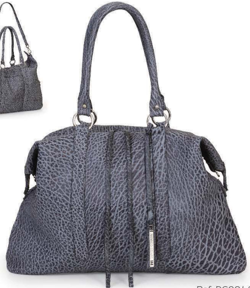
Ref: DG004/03 Black