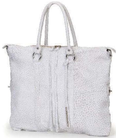
Ref: DG004/01 Feather

Juacira - DG004 Handbag in sheep leather. Can be used in three different ways H: 55cm W: 48cm D: 13cm