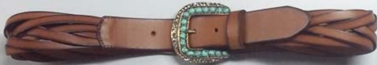
SG 2317 CAMELO/OVS INDIANO