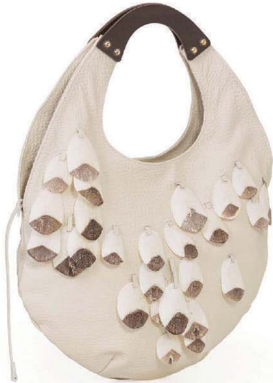
Ref: DG011/01 Cream