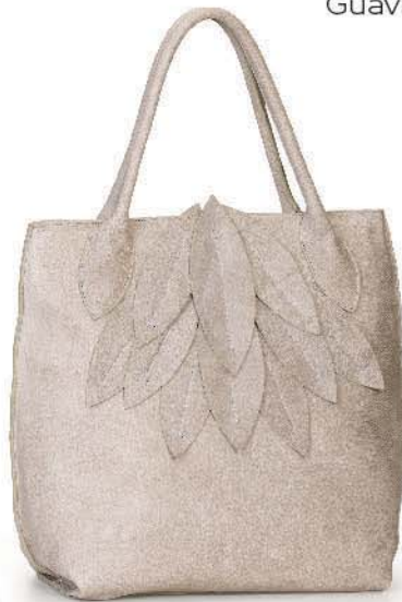
Ref: DG001/03 Off White