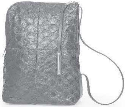
Ref: DG013/04 Camel

Thaynara - DG013 Sack Bag in Pirarucu fish leather H: 57cm W: 33cm D: 16cm